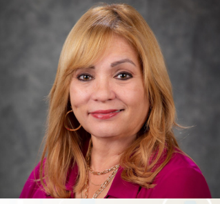
District 4 Commissioner The Honorable Maribel Gomez Cordero